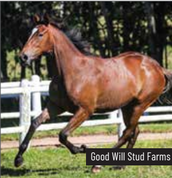
Good Will Stud Farms