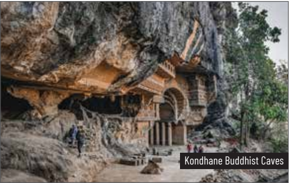
Kondhane Buddhist Caves