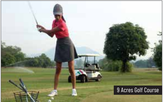
9 Acres Golf Course